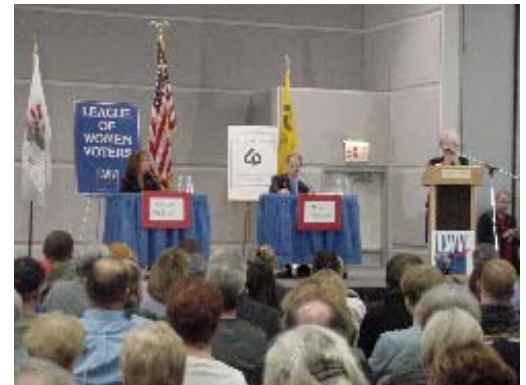
The highly anticipated 6 th District Congressional forum generated international attention.

The hour flew by with a lot of mud-slinging and some actual discussion on issues. The League was the only organization trusted by both campaigns to hold this debate, which was definitely a forum of national (and international) interest.